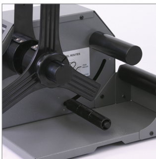
Auto-Adjust Take-Up Speed

Universal, Reliable and Durable Rewinder