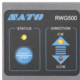
User-Friendly Operation Panel