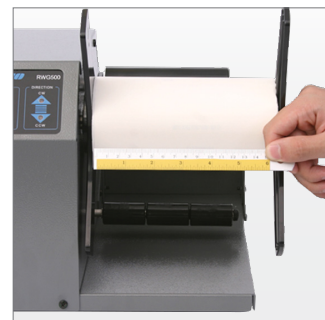
Up to 7-inch Wide Label Support