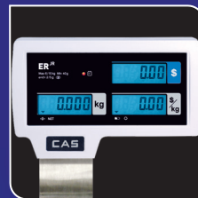
Pole Display Option