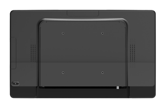
100 X 100 MM VESA MOUNT